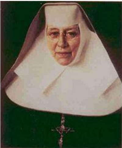
St. Katharine Drexel, S.B.S. Foundress of the Sisters of the Blessed Sacrament and Xavier University of Louisiana

Xavier University of Louisiana, founded by Saint Katharine Drexel and the Sisters of the Blessed Sacrament, is Catholic and historically Black. The ultimate purpose of the University is to contribute to the promotion of a more just and humane society by preparing its students to assume roles of leadership and service in a global society. This preparation takes place in a diverse learning and teaching environment that incorporates all relevant educational means, including research and community service.