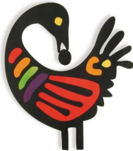
SANKOFA "go back to fetch it"