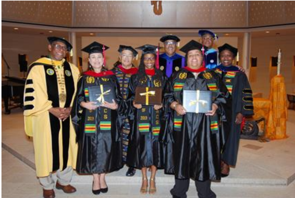
2019 Master's Degree Graduates with Administration, Faculty and Staff

3. If the Faculty panel decides that the student's Practicum Project is not of sufficient quality, the student can be asked to resubmit or to resubmit another Practicum Project.