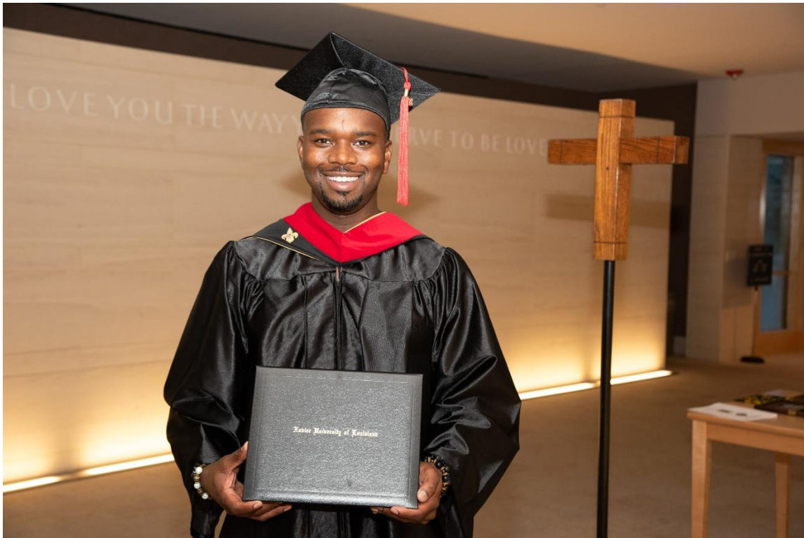
2021 Master's Degree Graduate