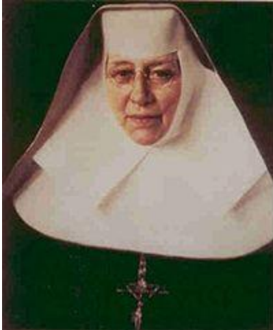
St. Katharine Drexel, S.B.S. Foundress of the Sisters of the Blessed Sacrament and Xavier University of Louisiana